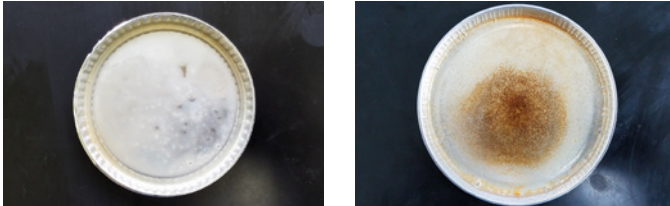
DIE SLICK® 1850