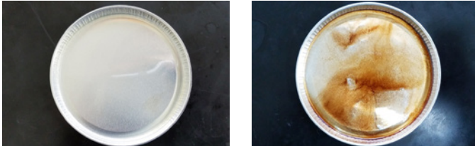
DIE SLICK® 2050