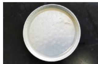
DIE SLICK® 4520